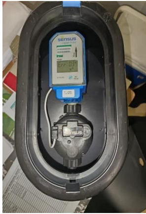
Figure 2 Prepaid Meter